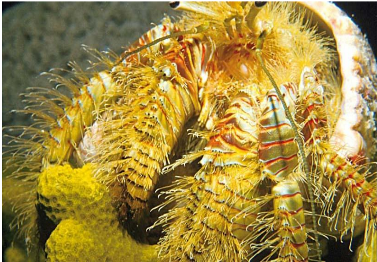
Here's a hairy hermit crab