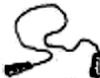
Jump Rope jump rope