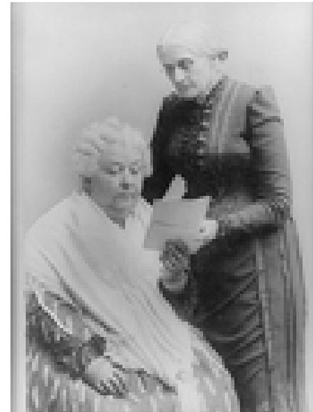
Elizabeth Cady Stanton (seated) and Susan B. Anthony working together.

Mrs. Stanton first met Miss Susan B. Anthony when the latter was a demure young Quakeress. The two ever worked together in friendship and sympathy. Mrs. Stanton said of their joint labors: