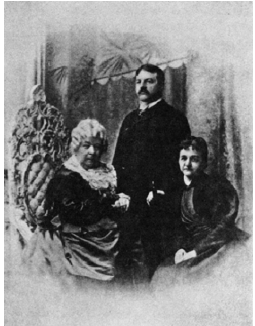
Elizabeth Cady Stanton on the occasion of her eightieth birthday.

Eight years later, while attending a world's anti-slavery convention in London, she made the acquaintance of Lucretia Mott. This resulted in the joint issuance of a call for a