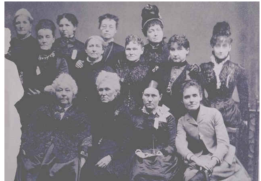
First International Convention of Women, Washington, D.C. Elizabeth Cady Stanton is at the lower left.

She was instrumental in having the question of woman suffrage submitted to Kansas in 1867 and Michigan in 1874. She was President of the National Committee of her party from 1855 to 1865. She was also identified with the Women's Loyal League and was President of the National Women's Suffrage Association unit 1883.